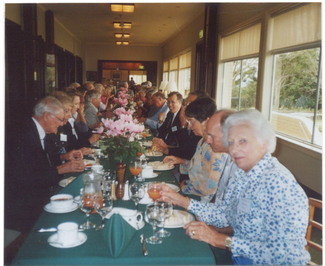
The Elanora Archiving Practices seminar Lunch at the Long Table