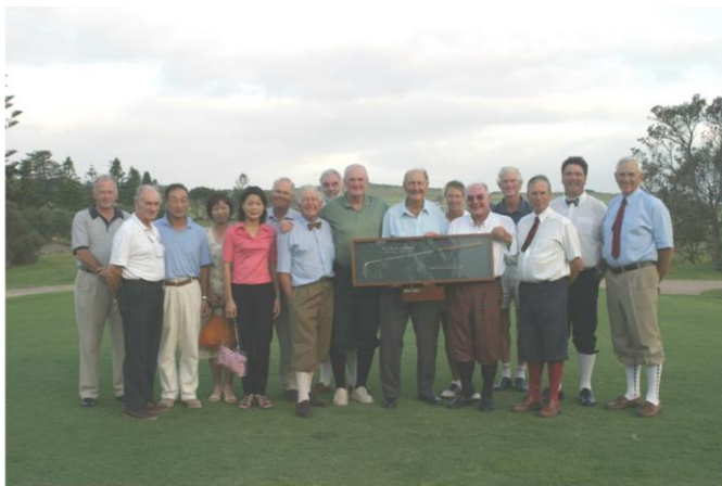
The field for the Dan Cullen Trophy, Long Reef GC, February 2004

For a number of unavoidable reasons the annual Interstate Challenge between 'The Golf Collectors Society' (NSW) and 'The Golf Society of Australia' (Vic.) had to be cancelled this year. It was to be played at Woodlands Golf Club, Victoria on 29 October. Members will be looking forward to the event next year.